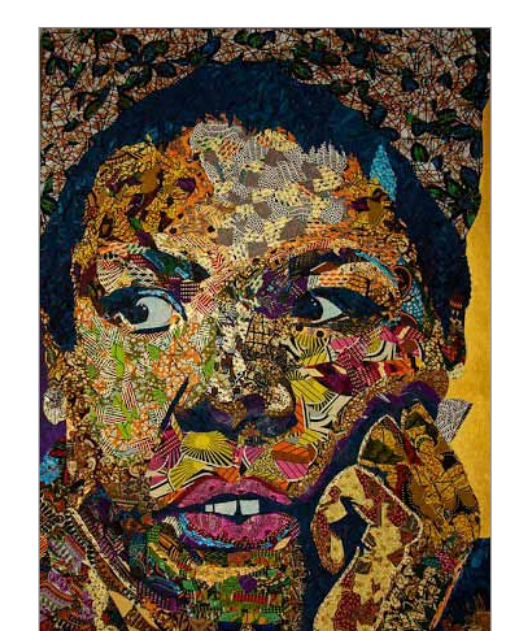
Apanaki Designs' "Mama's Watching"

Rise would like to offer a special thank you to RBC Foundation for its support of the PSL program this year.